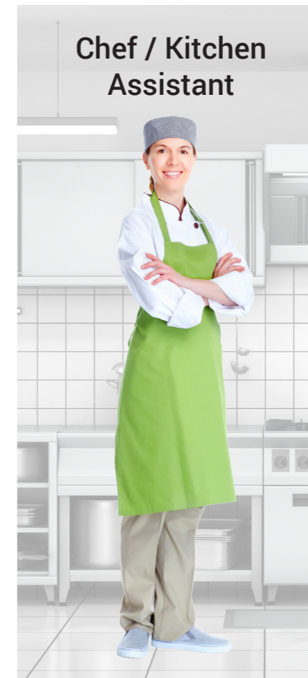
Chef / Kitchen Assistant